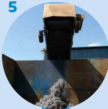
5 STEEL IS REMOVED FROM THE RUBBER