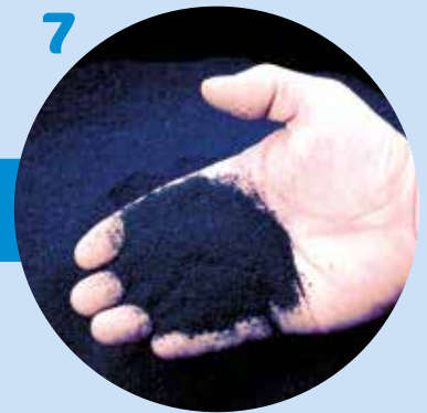
7 END PRODUCTS OF RUBBER CRUMB AND GRANULES