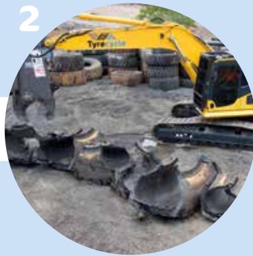
2 SHEAR OR SHREDDING FOR SIZE REDUCTION