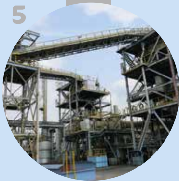
5 TDF BENEFICIALLY RE-USED TO REDUCE FOSSIL FUEL CONSUMPTION