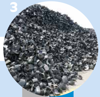
3 TDF AND GRANULATION FEEDSTOCK