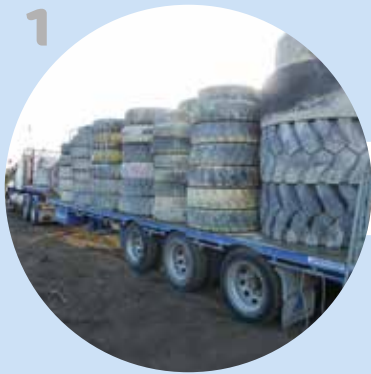
1 COLLECTION AND SORTING