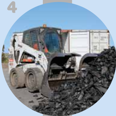
4 TDF SHIPPED TO ALTERNATIVE FUEL END USERS