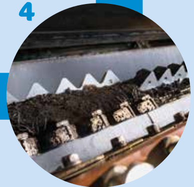
4 SHRED ENTERS RASPER TO LIBERATE STEEL