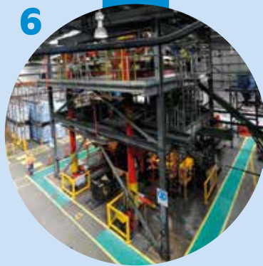
6 ENTERS THE GRINDING MILLS OR GRANULATORS FOR SIZING